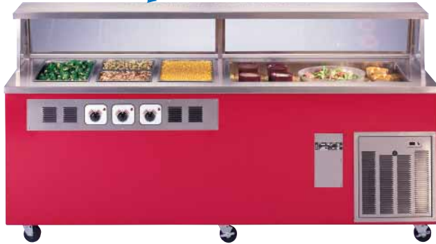
R3H3CM operator's side shown with optional CPG protector guard

The Reflections Hot/Cold Combo units are ideal for use in cafeteria/buffet lines, school line-ups, hospital cafeterias and lounges. With "works-in-a-drawer" access, these units are easy to maintain. The Reflections units are compatible and will interlock with other Piper Reflections units.